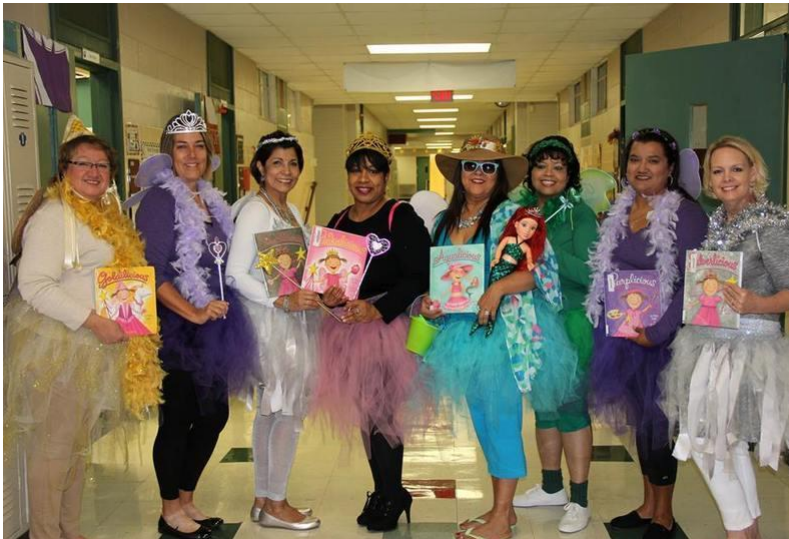
Great Day of Reading at Fairmeadows Elementary School