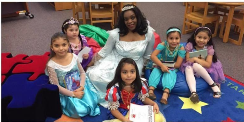
Storybook Character Day at Bilhartz Elementary School