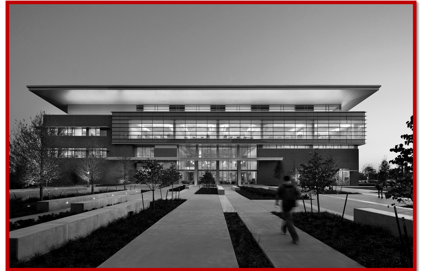
University of North Texas at Dallas