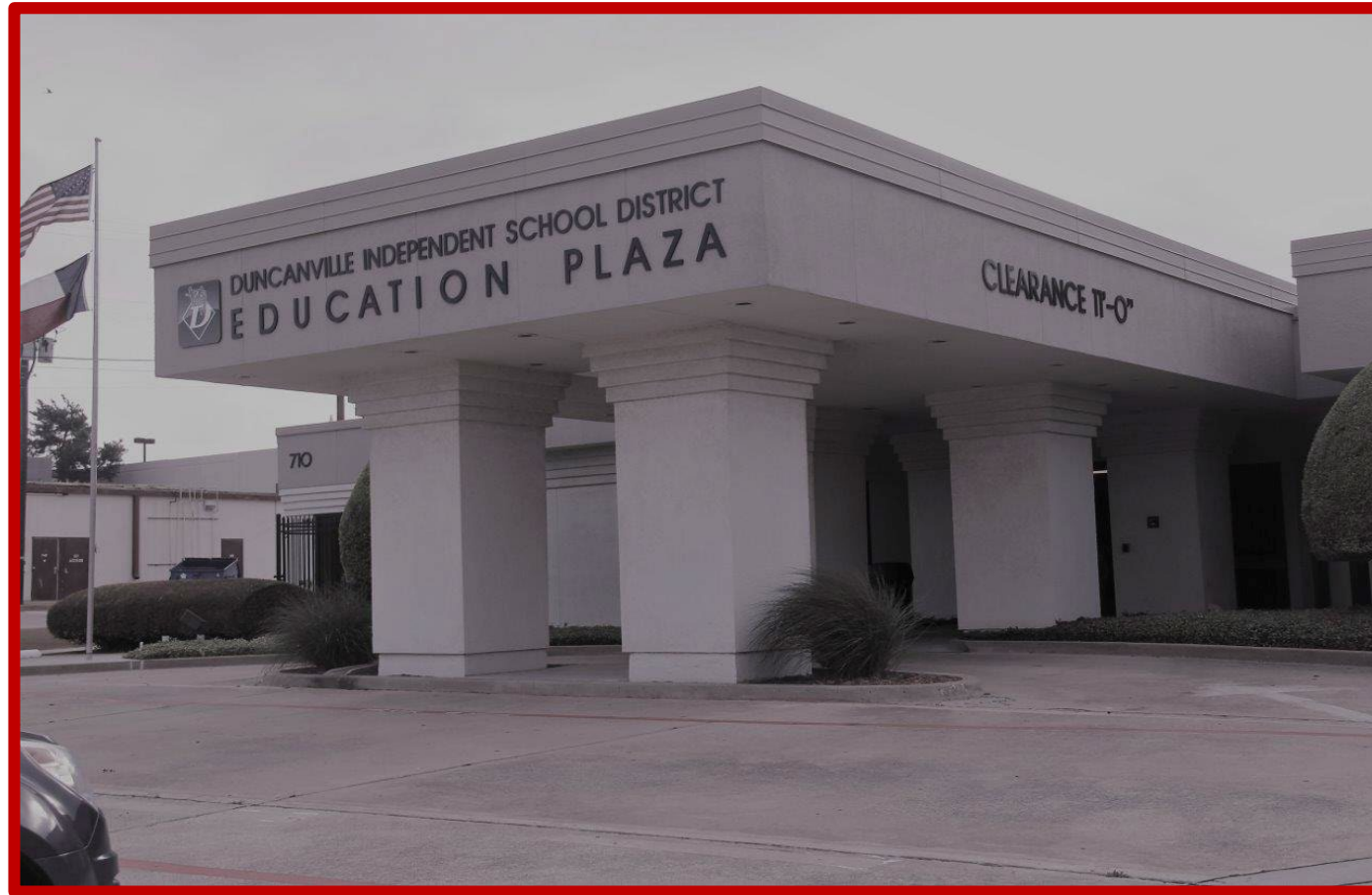
Duncanville Independent School District